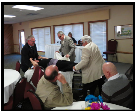
Murder Mystery Actors