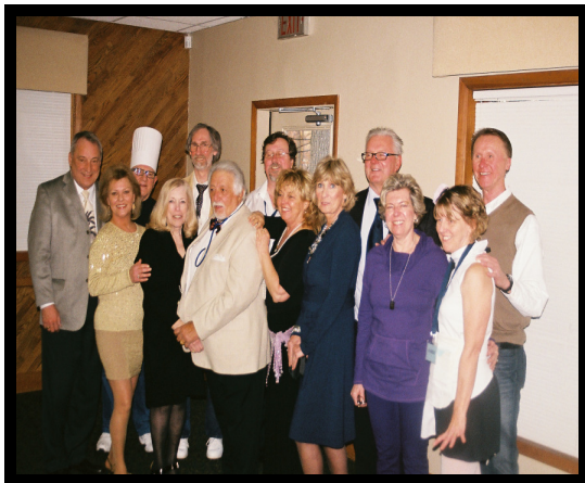
“Dinner at 8 Dead by 9” Murder Mystery Players