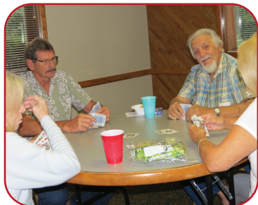
Card & Games Night...