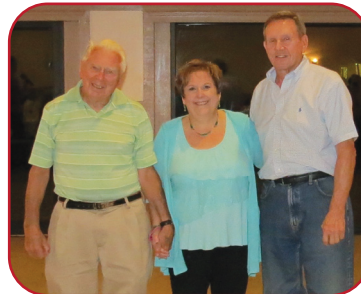
September Birthday Celebrants