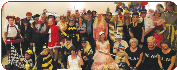
2015 Halloween Party