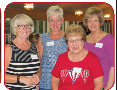
Thanks to the Helpers!