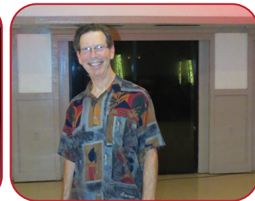
April's Birthday Celebrant!