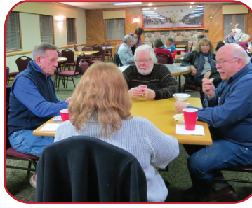
Card & Games Night...