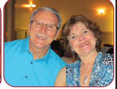
Enjoying a Great Time...