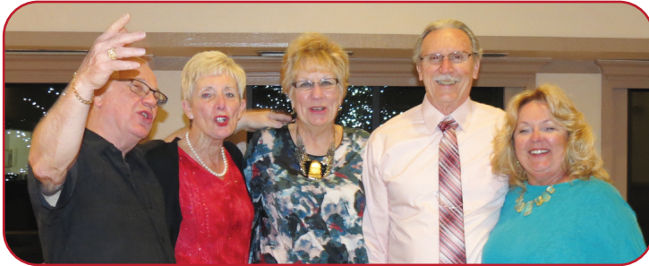
February Birthday Celebrants