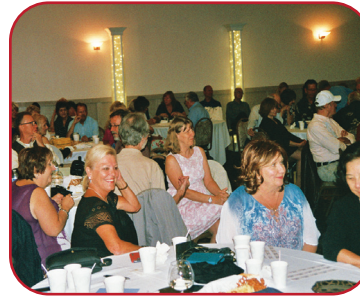
Members & Guests Enjoying Life...