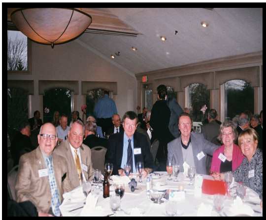
Non-Profit Coalition Dinner at Great Oaks Country Club